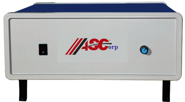
PCB Machine Controller